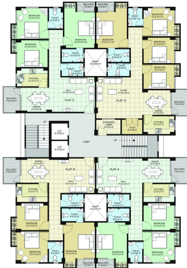
TYPICAL IST TO 8TH FLOOR PLAN BLOCK 'D'