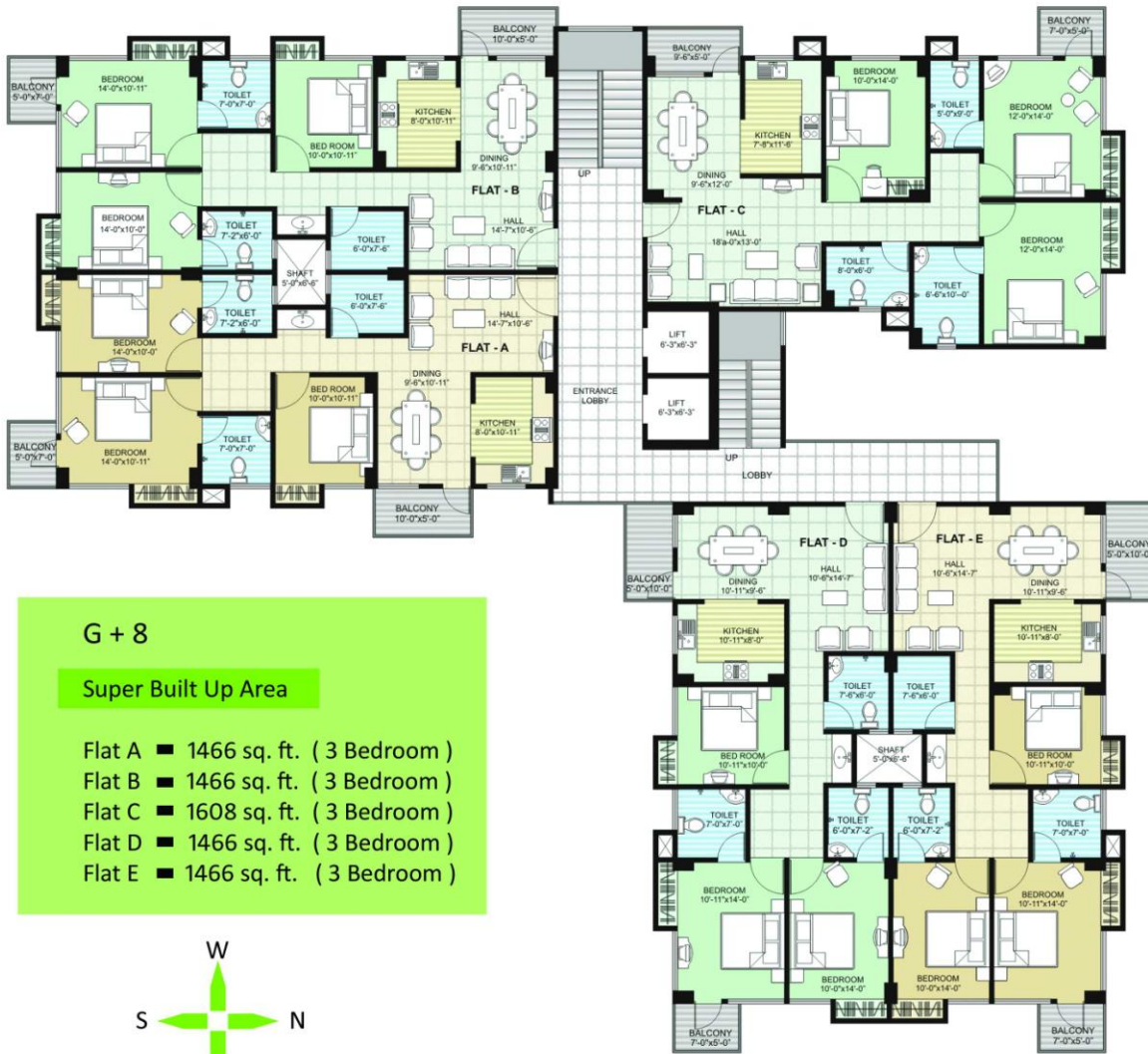
TYPICAL 1ST TO 8TH FLOOR PLAN BLOCK A