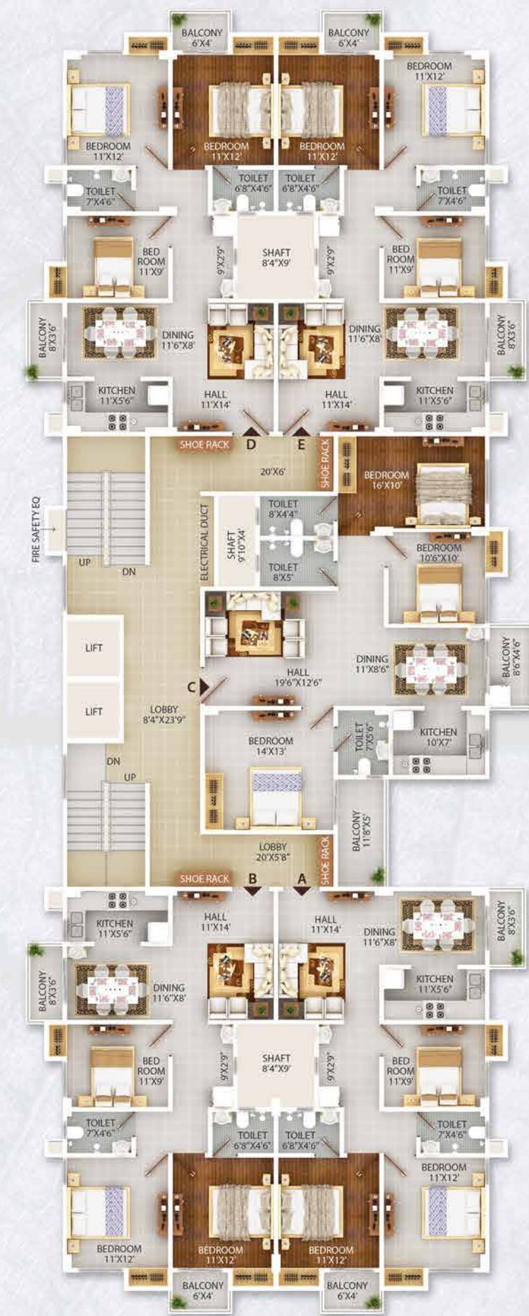
BLOCK - A | 3RD TO 7TH FLOOR